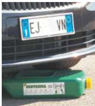
The large central pool area on top guarantees safe easy collection