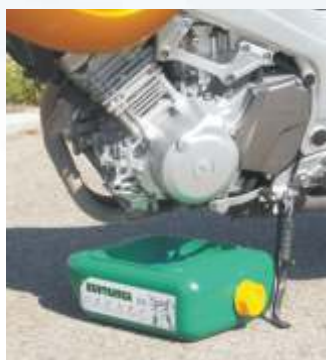
The practical sizes used for both car and motorcycle engines