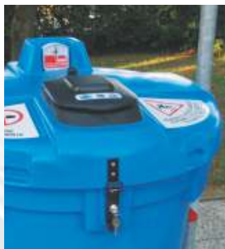
Secure and easy to transport to dedicated oil collection points